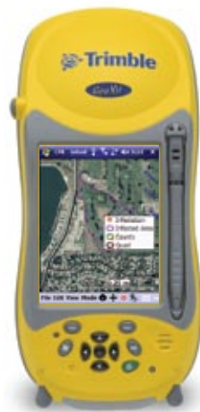
CartoPac Mobile running on a Trimble GPS device to illustrate the CartoPac Invasive Weed Mapping Solution that provides complete tools for the field user.